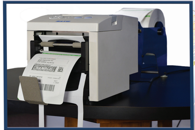
DuplexPackSlip® Label shown in PEELER TRAY